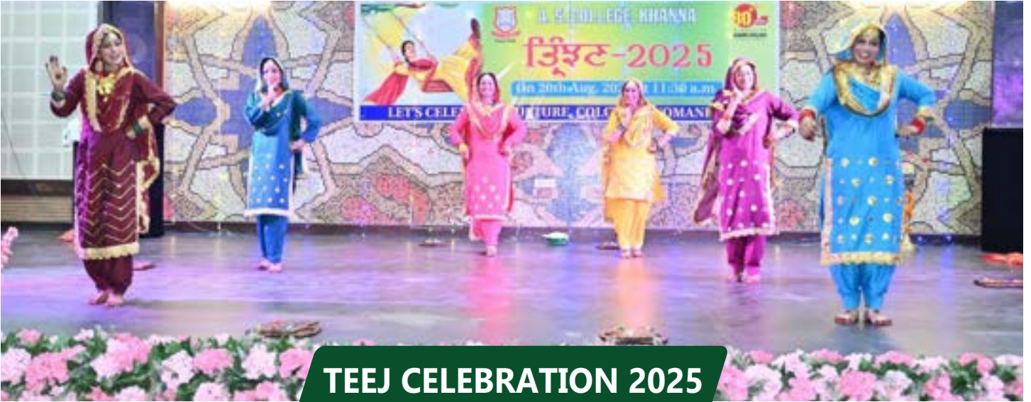
TEEJ CELEBRATION 2025