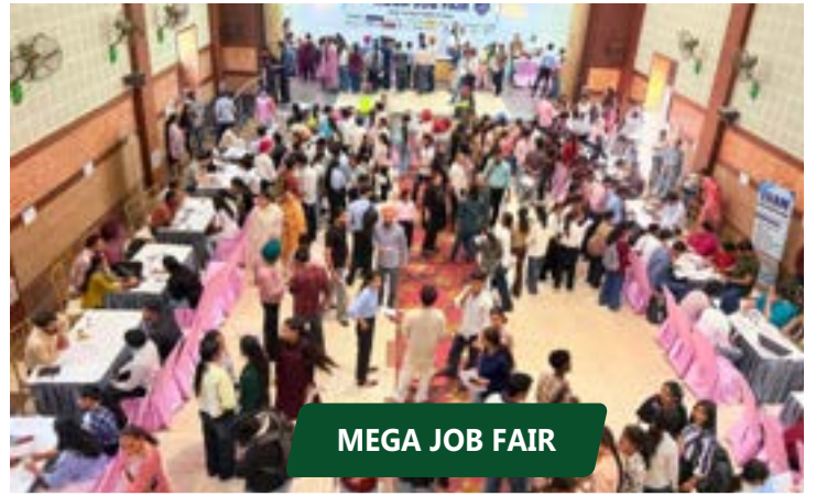
MEGA JOB FAIR