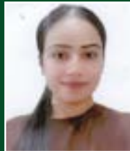
Purna B.Sc. III